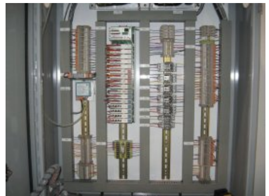
I/O Controls (Courtesy of Ford Motor Co.)