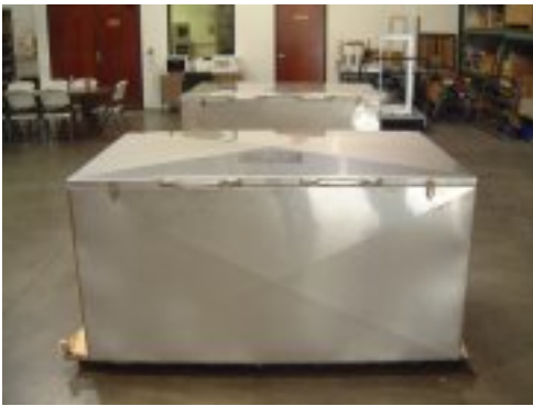
Lead Blanket Boxes

Webber EMI offers the capabilities to build many types of custom projects to meet any need. Whether it be designed by the customer or us we have the knowledge and ability to meet your products needs.