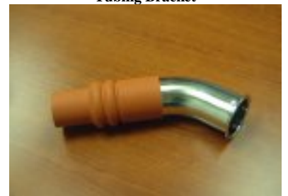
Flanged 45 with Rubber Reducer

Please contact us via phone, fax or e-mail for a free quotation.