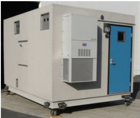
Portable Laboratory