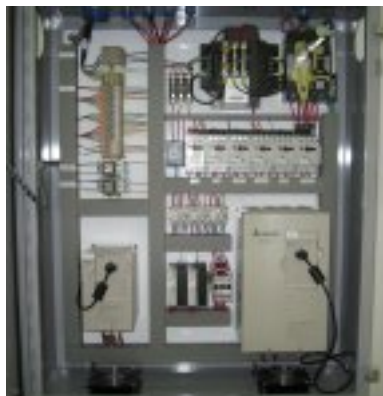
Power Distribution