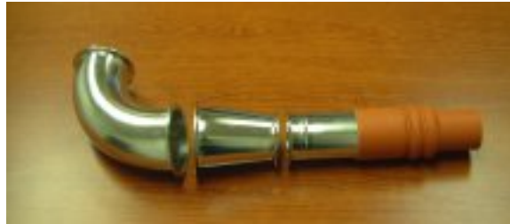
Flanged S.S. Reducer To Rubber Reducer