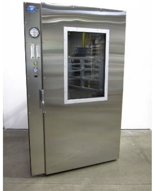
Air Shower