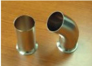
Flanged To Straight Pipe

Below is a brief sampling of the type of stainless steel fittings, connectors and brackets Webber EMI is capable of producing.