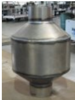
Caterpillar Converter (Courtesy of Applied Ceramics)