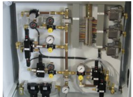
Pneumatic Controls