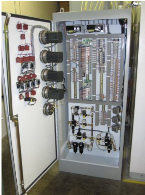
Running Loss Control System

Following is a brief overview of some of the machines and test systems developed and produced by Webber EMI.